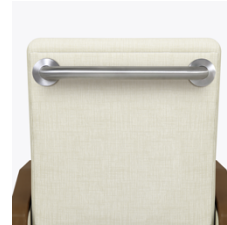
Optional Push Bar

Optional IV holder bracket and rod available.