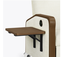
Optional Side Folding Table

Add the optional push bar across the top of the chair back to aid staff in positioning the chair.