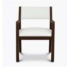
Optional Back Style

The seat cushion can be replaced in the field.