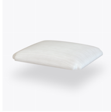
Seat Cushion is Field Replaceable

Our patented steel-reinforced joint system uses over 20 pieces of steel in most Kwalu chairs. Stop ongoing and costly furniture replacement.