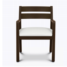
Optional Back Style

The seat cushion can be replaced in the field.