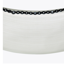
Tamper Proof Staple Cover

Laminate seat bottom with ventilation but no access to internal building materials and loose fabric; no visible staples, tamper-proof screws and brackets.