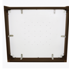
Tamper Proof Seat Protector

Our patented steel-reinforced joint system uses over 20 pieces of steel in most Kwalu chairs. Stop ongoing and costly furniture replacement.