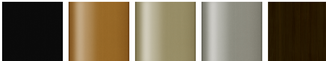
Premium Black (Classic)