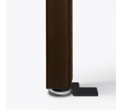
Optional Floor Mounting

Tamper proof staple cover does not allow upholstery staples to be removed.