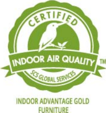
INDOOR ADVANTAGE GOLD FURNITURE