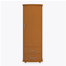
Other Wardrobe Styles

Standard clothing rod may be attached at ADA height of 48" from the floor.