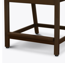
Easy to Use Footrest

Higher seat height designed to enable sitting without bending at the hip.