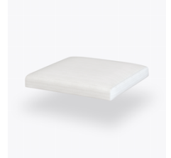
Seat Cushion is Field Replaceable

Adjustable non-skid glides are on all legs.