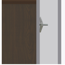
Wall Mount Hardware

Kwalu's proprietary finish doesn't have any of the drawbacks of wood. The finish is moisture impervious, easy to clean and maintenance-free.