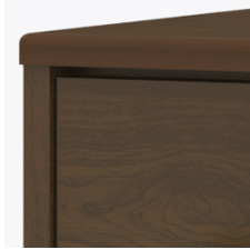
Waterfall Edging on Top

The kit and instructions for wall mounting are included with this product. The wall mount instructions provided must be followed carefully for a secure, durable, and long-lasting solution to ensure the safety of the unit and the user.