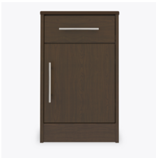
Other Bedside Styles

A top drawer lock is available and is optional.