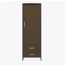
Other Wardrobe Styles

Choose from dozens of hardware styles, including ADA compliant options.