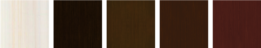
Wood Ash (Fusion)