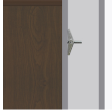
Wall Mount Hardware

Kwalu's proprietary finish doesn't have any of the drawbacks of wood. The finish is moisture impervious, easy to clean and maintenance-free.