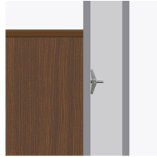
Wall Mount Hardware

Floor mounting is optional. A set of 4 brackets and screws to attach to the product are provided; the customer would have to buy additional screws to attach the bracket to the floor.