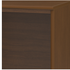
Bullnose Edging Finish

Kwalu's proprietary finish doesn't have any of the drawbacks of wood. The finish is moisture impervious, easy to clean and maintenance-free.