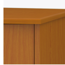
Optional Kwalu Top

Bumper protection keeps unit in pristine condition and protects unit from bumps and scuffs.