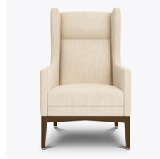
Number of Seats

Concealed cleanout eliminates a debris build-up behind the seat cushion.