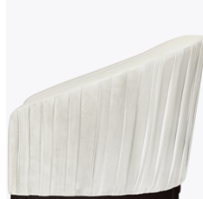
Optional Fabric Pleating Detail

Our patented steel-reinforced joint system uses over 20 pieces of steel in most Kwalu chairs. Stop ongoing and costly furniture replacement.