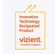
Vizient® Innovative Technology

Concealed cleanout eliminates a debris build-up behind the seat cushion.