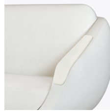
Optional Corian®/Hanex®/Krion® Arm Caps

Concealed cleanout eliminates a debris build-up behind the seat cushion.