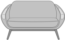
Diamante Love Seat, with Solid Surface Arm Caps Model: DIAM2211 61W 35D 37H 24.25AH