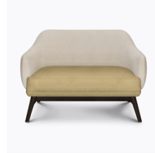
Optional Fabric Zones

Concealed cleanout eliminates a debris build-up behind the seat cushion.