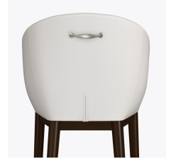
Optional Back Handle

An optional cutout on back is available to prevent buildup of debris and provide for easy maintenance.