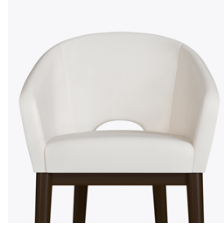
Optional Cutout on Back

An optional cutout on back is available to prevent buildup of debris and provide for easy maintenance.