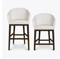
Bar and Counter Height

Concealed cleanout eliminates a debris build-up behind the seat cushion.