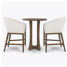
Coordinates with Counter Height Stools

Kwalu's proprietary finish doesn't have any of the drawbacks of wood. The finish is moisture impervious, easy to clean and maintenance-free.