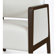
Optional Closed Arm Panels

Choose from 3 seat styles – lounge chair, love seat, and sofa.