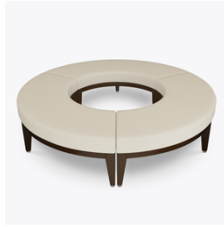
Coordinates with other Benches

Our patented steel-reinforced joint system uses over 20 pieces of steel in most Kwalu chairs. Stop ongoing and costly furniture replacement.