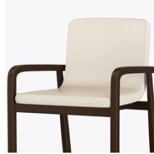
Optional Taller Back Cushion