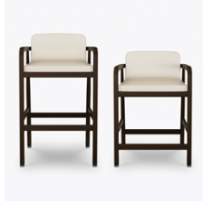
Bar and Counter Height

Our patented steel-reinforced joint system uses over 20 pieces of steel in most Kwalu chairs. Stop ongoing and costly furniture replacement.