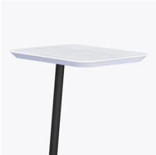
Corian®/ Hanex®/ Krion® Top

Table features a 1" solid surface top with elliptical edge detailing.