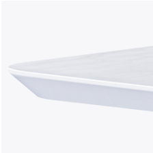
Elliptical Edge Detail on Top