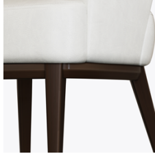
Contoured Seat Rails

Kwalu's solid surface (1/8" thick) proprietary finish doesn't have any of the drawbacks of wood. The frames are moisture impervious, graffiti-resistant, easy to clean and maintenance-free.