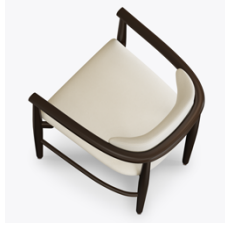
Curved Back Design

The seat cushion can be replaced in the field.