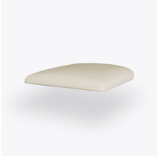
Seat Cushion is Field Replaceable

The seat cushion can be replaced in the field.