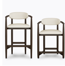
Bar and Counter Height

Our patented steel-reinforced joint system uses over 20 pieces of steel in most Kwalu chairs. Stop ongoing and costly furniture replacement.