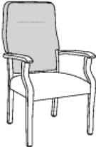
11 With Cleanout