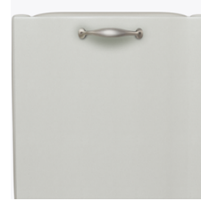
Optional Back Handle

A back handle is available to assist in moving the chair and it is optional.