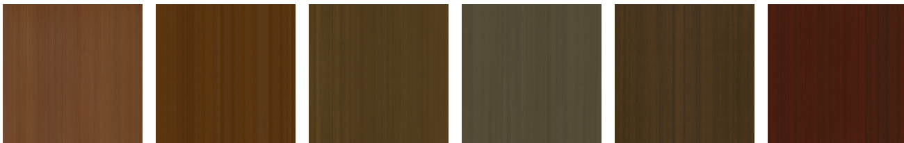
Medium Cherry English Chestnut Light Walnut Silver Ash Golden Ebony African Mahogany