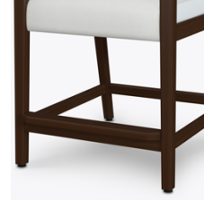
Easy to Use Footrest

Higher seat height designed to enable sitting without bending at the hip.