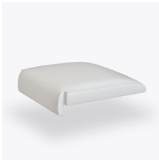
Seat Cushion is Field Replaceable

Cleanout is incorporated behind the seat cushion to prevent buildup of debris while providing a clean look.