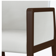
Optional Closed Arm Panels

The seat cushion can be replaced in the field.