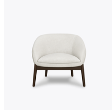
Number of Seats

Concealed cleanout eliminates a debris build-up behind the seat cushion.