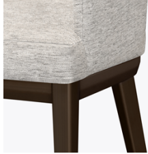
Contoured Seat Rails

Kwalu's solid surface (1/8" thick) proprietary finish doesn't have any of the drawbacks of wood. The frames are moisture impervious, graffiti-resistant, easy to clean and maintenance-free.