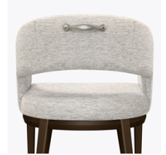
Optional Back Handle

A back handle is available to assist in moving the chair and it is optional.