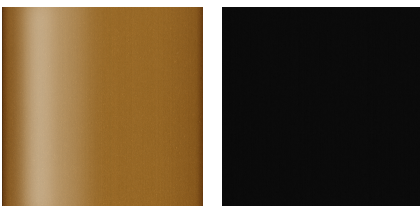
Premium Pure Copper