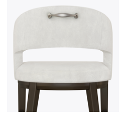
Optional Back Handle

A back handle is available to assist in moving the chair and it is optional.