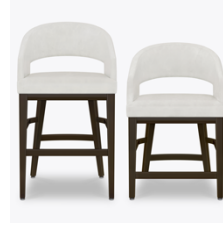
Bar and Counter Height

Back Cutout prevents build-up of debris and provides for easy maintenance.