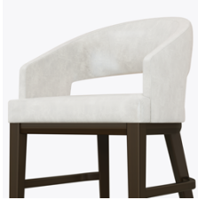
Contoured Seat Rails

Kwalu's solid surface (1/8" thick) proprietary finish doesn't have any of the drawbacks of wood. The frames are moisture impervious, graffiti-resistant, easy to clean and maintenance-free.