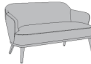
21 Love Seat