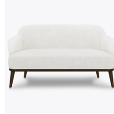
Number of Seats

Optional piping available on arms, back and seat only.