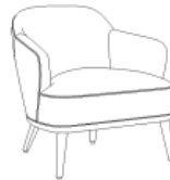
1 With Piping