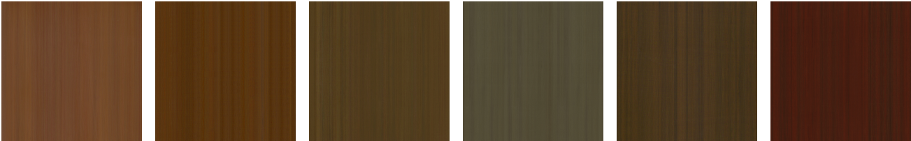
Medium Cherry English Chestnut Light Walnut Silver Ash Golden Ebony African Mahogany