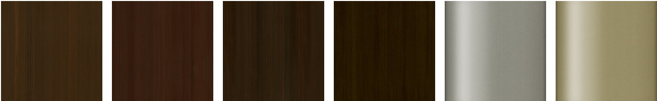
Espresso Natural Mahogany Midnight Oak Blackwood Premium Platinum Premium Soft Gold