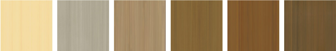
Sugar Maple Weathered Teak Northern Oak Vintage Teak Patagonian Cherry Northern Walnut