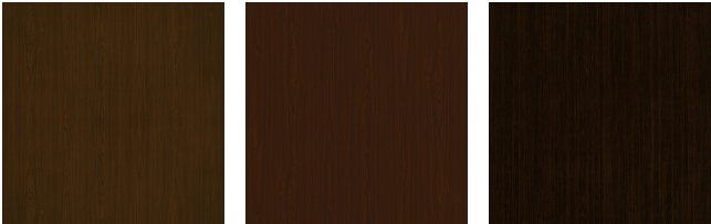
Espresso Natural Mahogany Midnight Oak