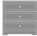
Mission Chest Wide, 3 Drawers Model: MICH30W 31.5W 19D 30H