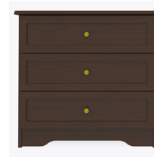
Optional Wider Version

Are constructed with both dowel and mechanical fasteners for additional strength. 100lb static and dynamic load Euro Drawer Slides allow for easy opening and closing.