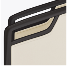
Cut Out Arm Detail

Distinctive arm cut out detail allows for easy handling of the chair.