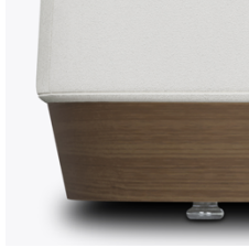
Tapered Plinth Base

Kwalu's proprietary finish doesn't have any of the drawbacks of wood. The finish is moisture impervious, easy to clean and maintenance-free.