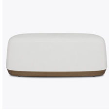
Available as Bench

The base of the Minori Bench and Ottoman is a unique tapered plinth design.