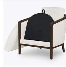
Removable Seat Deck

Concealed cleanout eliminates a debris build-up behind the seat cushion.