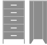
Essex Chest, 5 Drawers Model: EXCH50 24.25W 20D 46.75H