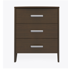
Other Chest Styles

Are constructed with both dowel and mechanical fasteners for additional strength. 100lb static and dynamic load Euro Drawer Slides allow for easy opening and closing.