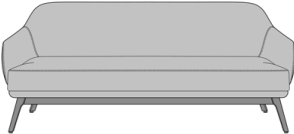
Emarese Sofa Model: EMAR3111 79W 28D 33H 24.5AH