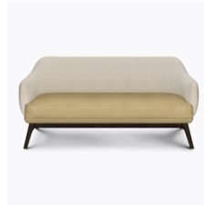
Optional Fabric Zones

Concealed cleanout eliminates a debris build-up behind the seat cushion.