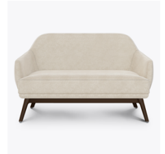
Number of Seats

The selection of varied fabric placement on the seat, back and above the seat rail is optional.