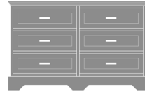
Dorchester Dresser, 6 Drawers Model: DODR60 48.5W 19.25D 30.75H