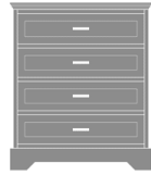
Dorchester Chest Wide, 4 Drawers Model: DOCH40W 31.5W 19.25D 36.75H