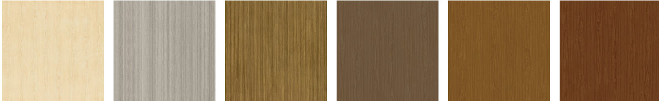
Sugar Maple Weathered Teak Vintage Teak Light Walnut Patagonian Cherry Medium Cherry