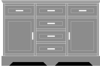
Dorchester Credenza Station – 48”W Model: DOBF62S48 48W 18D 32H