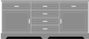
Dorchester Credenza Station – 72”W Model: DOBF62S72 72W 18D 32H