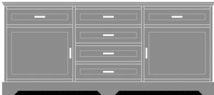
Dorchester Credenza Station – 72”W Model: DOBF62S72 72W 18D 32H