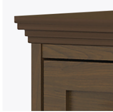
Reverse OG Edging on Top

Kwalu's proprietary finish doesn't have any of the drawbacks of wood. The finish is moisture impervious, easy to clean and maintenance-free.