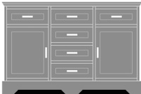
Dorchester Credenza Station – 48”W Model: DOBF62S48 48W 18D 32H