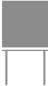
Behavioral Benessere Complete Table, 42" Square, Chippendale Legs, Bullnose 3/4" Wheelchair Height Model: 32362BH 42W 42D 31.75H