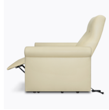
Three Position Recliner

Concealed cleanout eliminates a debris build-up behind the seat cushion.