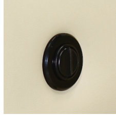
2 Button Control

Power recline with full-lift capability is activated by a 2 button control.