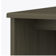
Waterfall Edging on Top

Kwalu's proprietary finish doesn't have any of the drawbacks of wood. The finish is moisture impervious, easy to clean and maintenance-free.