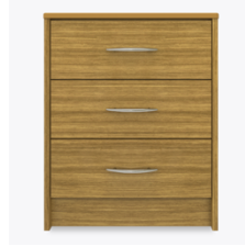
Other Chest Styles

Are constructed with both dowel and mechanical fasteners for additional strength. 100lb static and dynamic load Euro Drawer Slides allow for easy opening and closing.