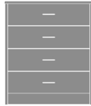
Atlanta Chest Wide, 4 Drawers Model: ATCH40W 31.75W 18.5D 37H