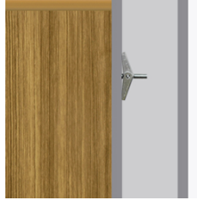
Wall Mount Hardware

Kwalu's proprietary finish doesn't have any of the drawbacks of wood. The finish is moisture impervious, easy to clean and maintenance-free.