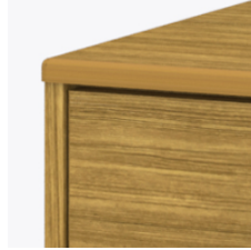
Waterfall Edging on Top

The kit and instructions for wall mounting are included with this product. The wall mount instructions provided must be followed carefully for a secure, durable, and long-lasting solution to ensure the safety of the unit and the user.