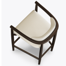
Curved Back Design

The seat cushion can be replaced in the field.