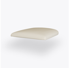
Seat Cushion is Field Replaceable

The seat cushion can be replaced in the field.