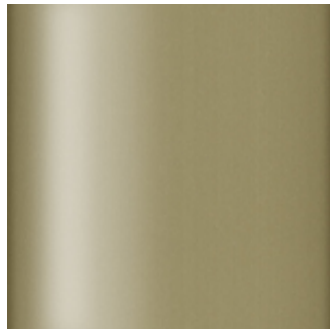
Premium Soft Gold