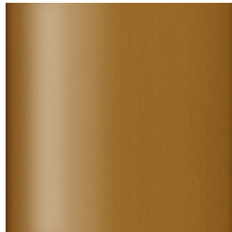
Premium Pure Copper