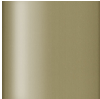
Premium Soft Gold