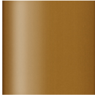
Premium Pure Copper