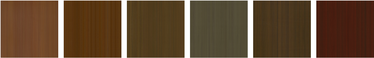
Medium Cherry English Chestnut Light Walnut Silver Ash Golden Ebony African Mahogany